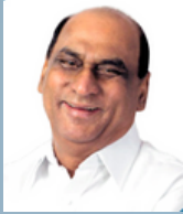
Shri. Dattaji Meghe Hon. Chancellor-DMIHER (DU) Ex-Member of Parliament (Lok Sabha / Rajya Sabha)